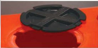
Large 8" fill hole speeds filling process, includes twist-lock plastic cap