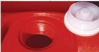
Tamper resistant, offset drain plug with coarse buttress thread