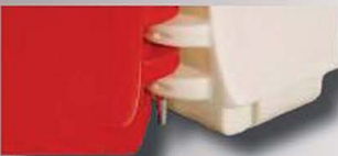
Water-Cable Barrier can pivot 30-degrees and be locked together with steel connection pins