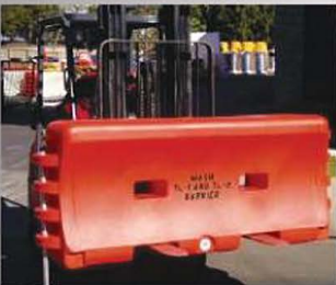
Water-Cable Barrier can be easily lifted and placed using a forklift or pallet jack