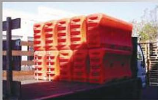
Water-Cable Barrier stacks for storage and transportation

Water-Cable Barrier to be 72" (1.9 m) long x 18" (0.46 m) wide x 32" (0.8 m) tall and molded from polyethylene. Water-Cable Barrier to be MASH tested, passed and eligible for TL-1 31 mph (50 km/hr) and TL-2 43.5 mph (70 km/hr) barrier applications. Individual wall shall weigh 100 lbs (45.4 kg) including internal cables empty and 1,070 lbs. (485.3 kg) when filled. Three 3/8" diameter stranded steel cables are molded into the wall to contain the impacting vehicle during an accident. Standard colors are orange/red and white, product may also be produced in other colors. Water-Cable Barrier modules are connected together with galvanized steel T-pins passing through a double wall knuckle which minimizes breakage at hinge points. Water-Cable Barrier shall pivot up to 30 degrees when connected. Water-Cable Barrier to have one 8 in (203 mm) diameter fill hole for quick filling and a twist lock cap for closure. Water-Cable Barrier will have molded fork lift slots to provide easy movement. Drain plug to be centered on the modules to protect against cracking or breaking and have coarse buttress threads for quick removal and insertion. Water-Cable Barriers shall stack for easy movement and storage.