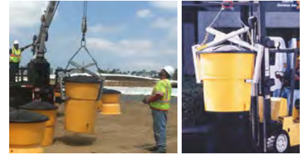
Easy lift with Lifting Ring