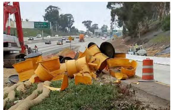
Big Sandys perform as tested with break upon impact plastic