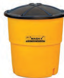
1,400 lbs. (635 kg.) #48140