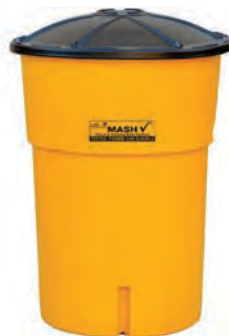
2,100 lbs. (953 kg.) #48210