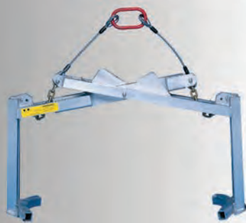
For easy lifting with a forklift, the Big Sandy Lifting Ring is also available #48001-LR