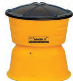
700 lbs. (318 kg.) / 400 lbs. (181 kg.) / 200 lbs. (91 kg.) #48001-LR