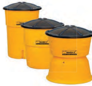
Three separate barrels available